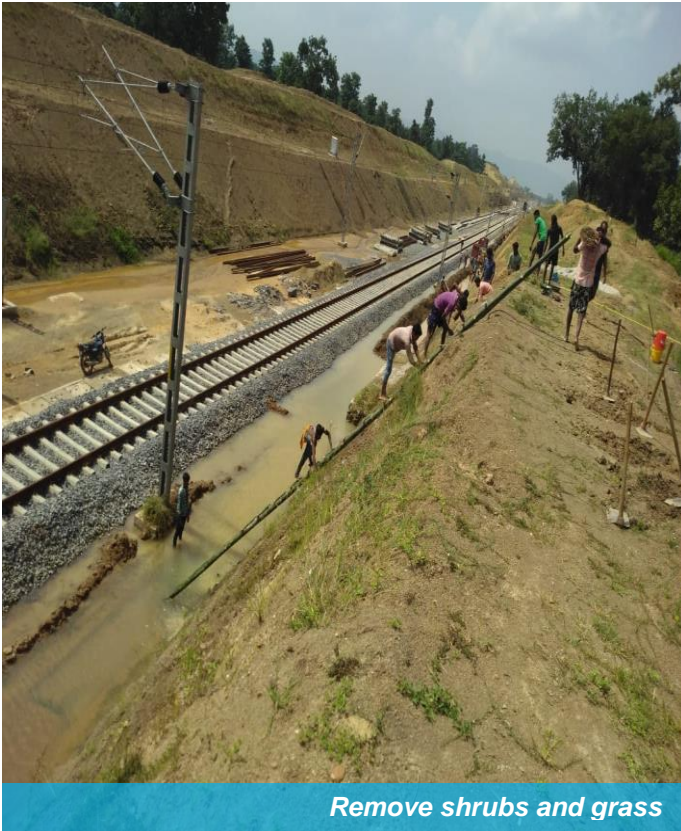
Remove shrubs and grass