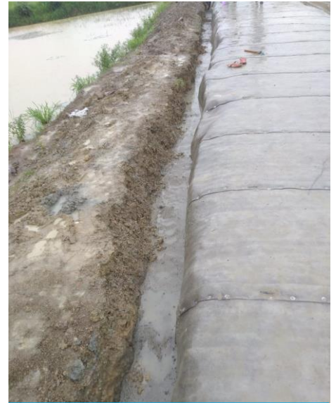
Concreting on anchor trench