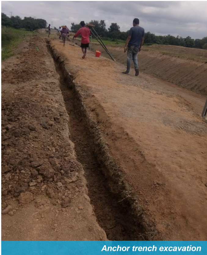
Anchor trench excavation