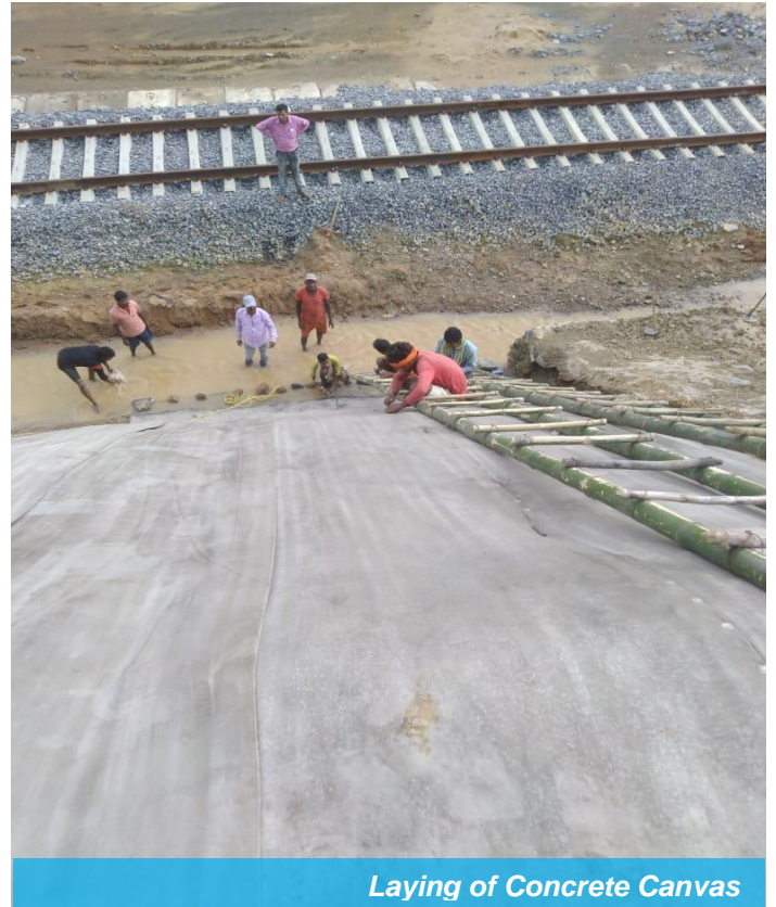
Laying of Concrete Canvas