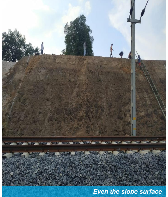
Even the slope surface