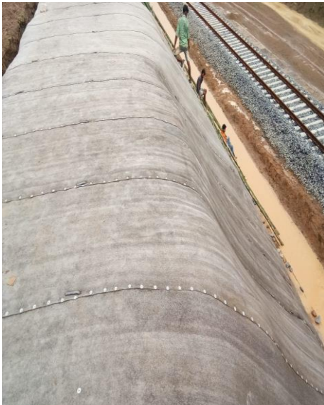
Screwing and Pegging