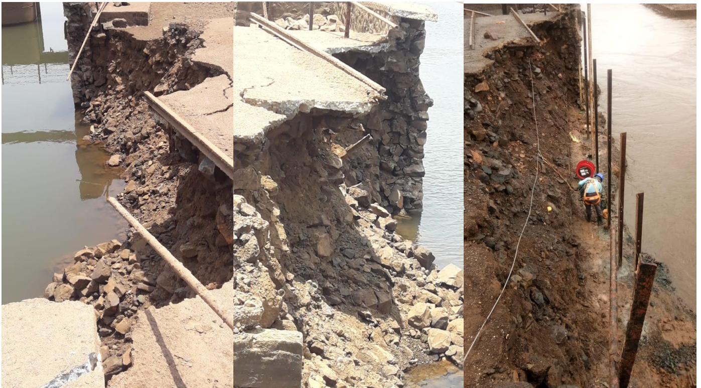
Side view of Damaged Canal