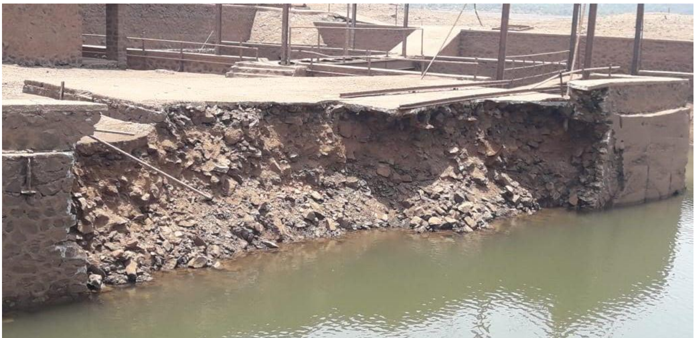
Front view of Damaged Canal