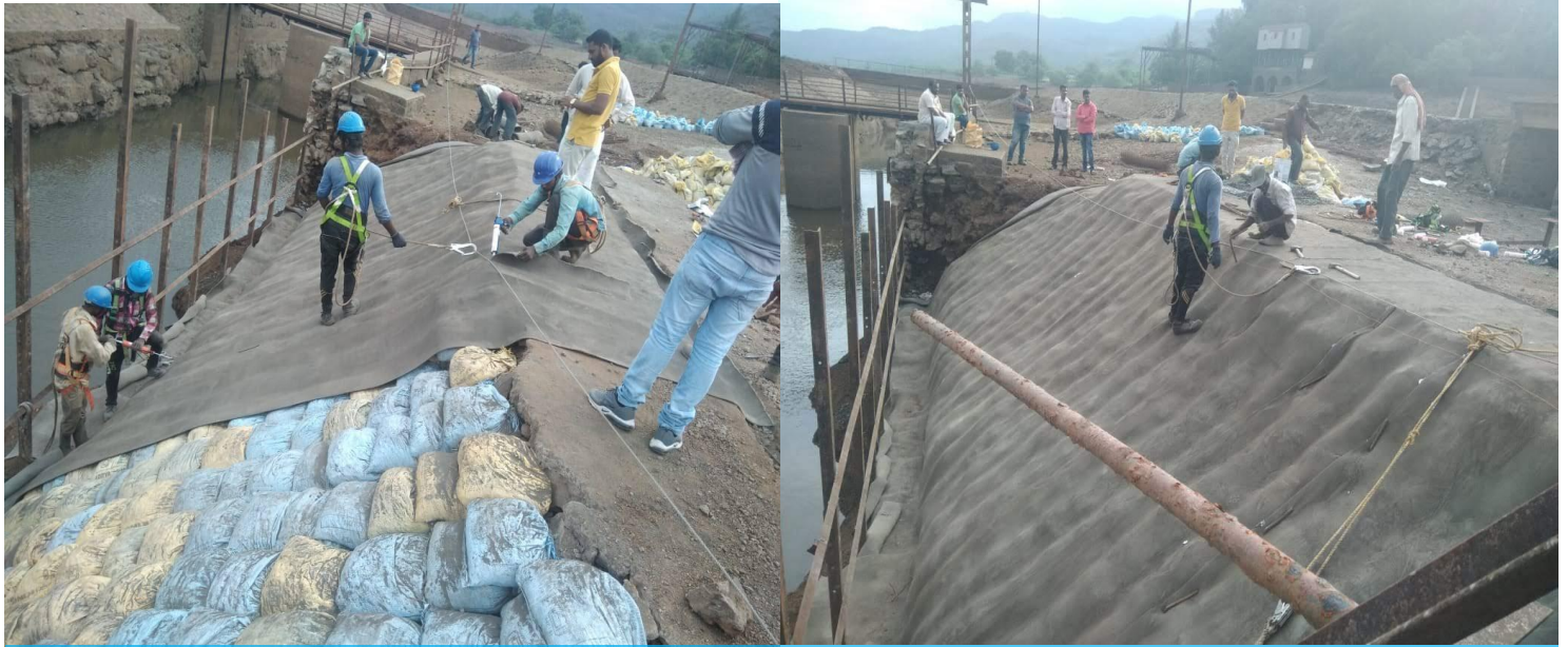
Concrete Canvas Installation