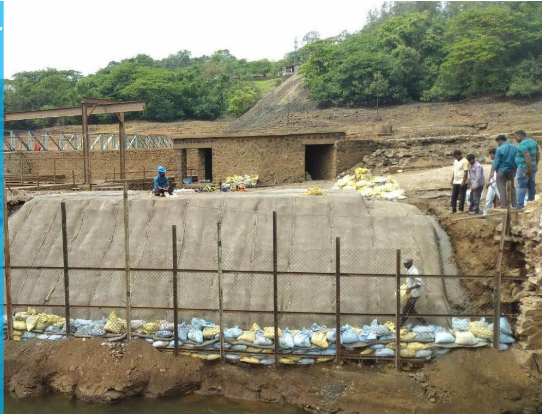
Canal Repair at Dewdi, Mulshi

The Major Section of Dewdi Canal was damaged on last week of June 2019 due to seepages and erosion issues in existing old lining. The portion of above 3m in height and 20m collapse suddenly and water starts entering the soil strata immediately, which need to be treated urgently in stipulated time to avoid other issues at canal. The project came with several challenges, including slope cutting, matching uniformity in work, stabilization of slope by placing sand bags, etc.